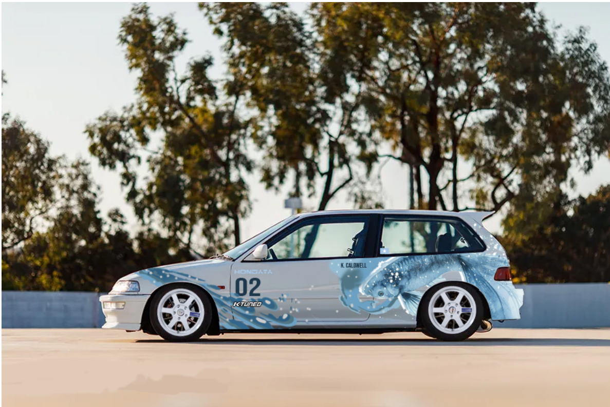
Figure 1: Initial Concept Rendering – Asymmetrical Blue Koi Livery